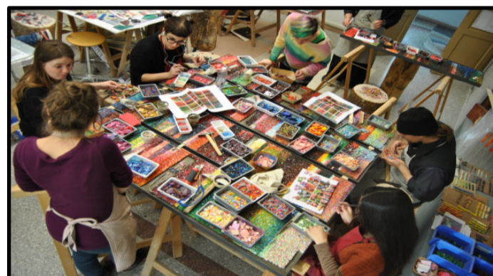
Spilimbergo Mosaic School today