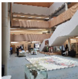
The Hive, Worcester

We continue with our last two presentations of our 2019/20 season and begin our 2020/21 season with our Annual General Meeting in April.