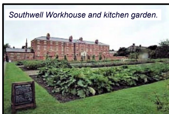
Southwell Workhouse and kitchen garden.

www.nationaltrust.org.uk/the-workhouse-southwell