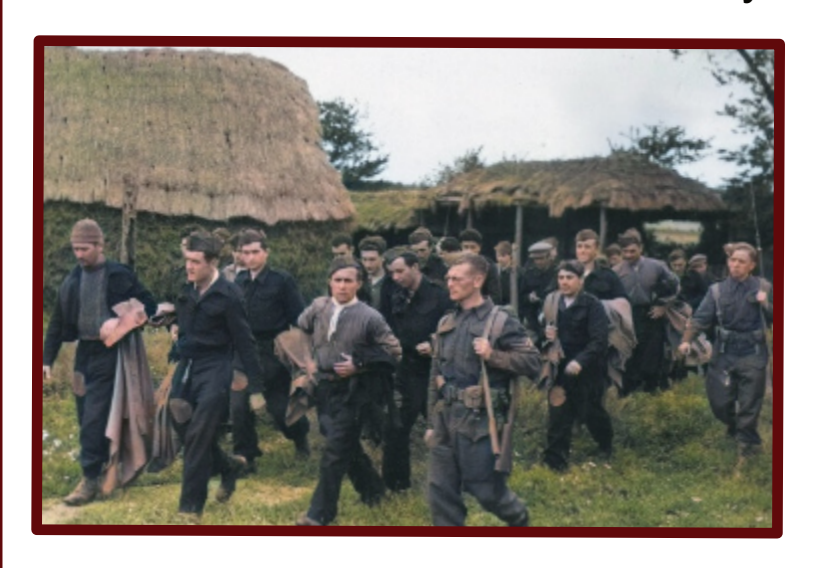
Left: Italian POWs working in the coutryside

This was a mixed farm with a dairy herd, pigs, chickens and a working horse.