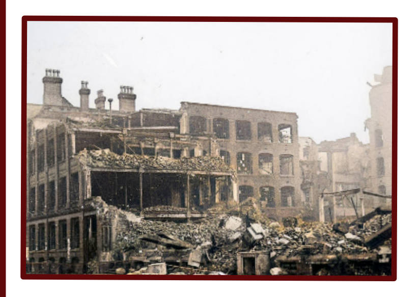
Left: Birmingham Bombing WW2

He gave a fascinating image of how life was at this time.