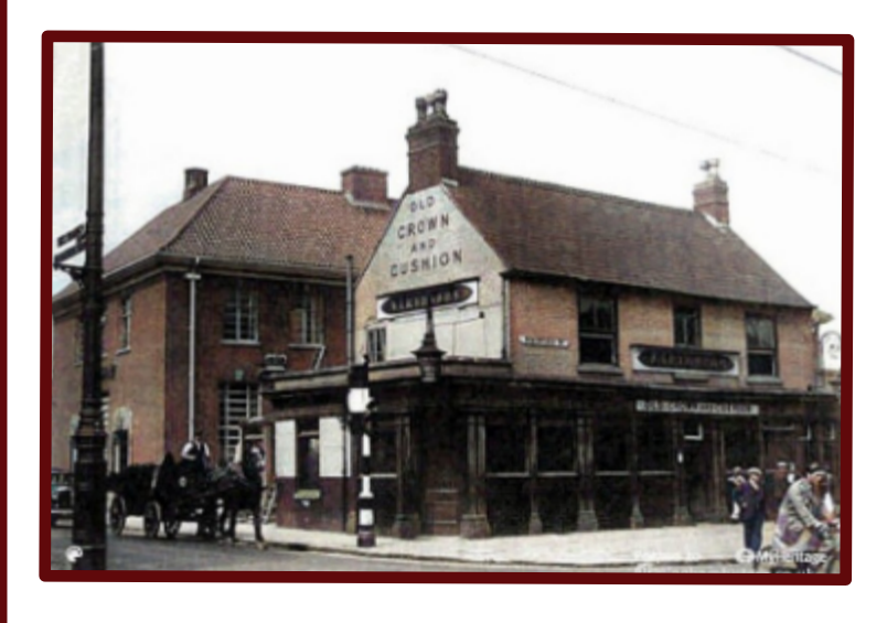
Left: Birchfield Road Perry Barr 1930s

Born in Birmingham, which was heavily bombed by the Luftwaffe, he recounted his childhood adventures from growing up in Perry Barr, moving out to the countryside and moving back to Birmingham during this period.