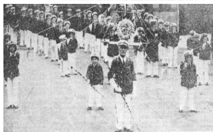
REDDITCH JAZZ BAND—FIRST PRIZE.